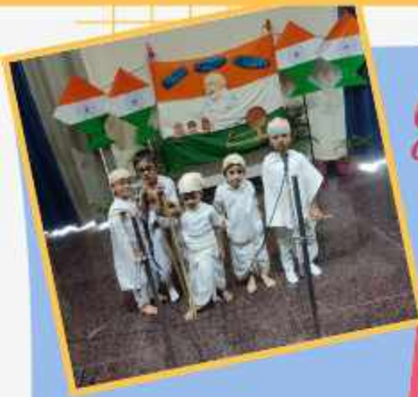
Gandhi Jayanti Celebration