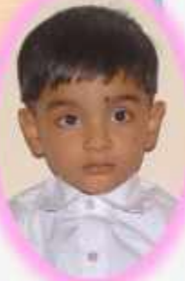
RUDRAKSH RANA PREP MIDDLE